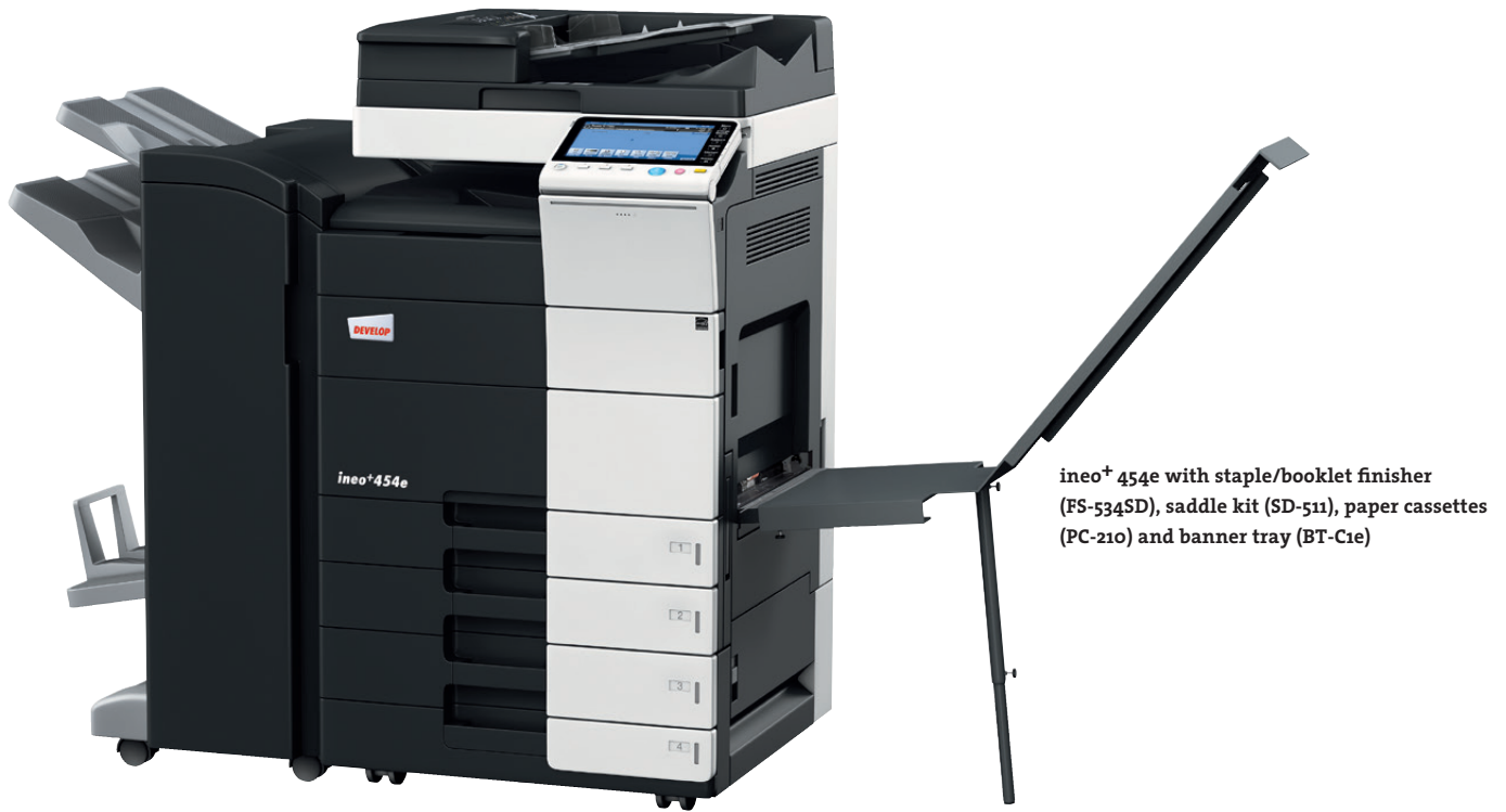
ineo+ 454e with staple/booklet finisher (FS-534SD), saddle kit (SD-511), paper cassettes (PC-210) and banner tray (BT-C1e)