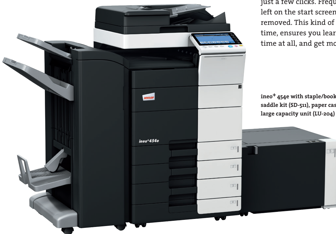
ineo+ 454e with staple/booklet finisher (FS-534SD), saddle kit (SD-511), paper cassettes (PC-210) and large capacity unit (LU-204)

Many multifunctional office systems are anything but user-friendly. The ineo+ 454e, in contrast, is simplicity itself. An intuitive, easily understandable operating concept ensures that it is as easy to use as your smartphone or tablet. The 9-inch capacitive touchscreen comes with well-known multi-touch operations such as flick, drag&drop or pinch in&out. Thanks to a new menu navigation structure you can also see all functions in one go and select the settings you want with just a few clicks. Frequently used functions can be left on the start screen and ones you don't use simply removed. This kind of customisation saves you lots of time, ensures you learn to operate the system in no time at all, and get more fun out of routine office jobs.