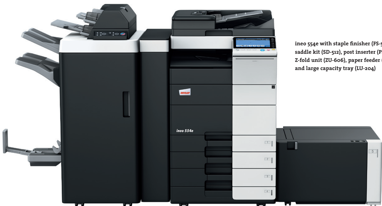
ineo 554e with staple finisher (FS-535), saddle kit (SD-512), post inserter (PI-505), Z-fold unit (ZU-606), paper feeder (PC-210) and large capacity tray (LU-204)

Each of these multifunctional office devices – the ineo 224e, ineo 284e, the ineo 364e, the ineo 454e and the ineo 554e – is not only remarkably easy to use but also offers a wide variety of features to facilitate everyday office tasks. By saving office users time in printing, copying or scanning, they can return to their normal work faster. And that will ultimately help boost productivity.