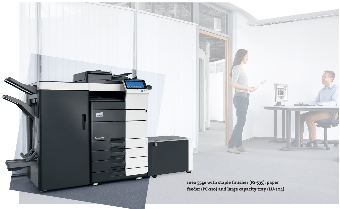
ineo 554e with staple finisher (FS-535), paper feeder (PC-210) and large capacity tray (LU-204)

These black-and-white systems come with a number of energy-saving features that cut power consumption by over 40% compared to predecessor models. While this kind of economy saves money, other green features are ecologically beneficial. And that means DEVELOP's ineo e line-up is not only good for the environment but also boosts the owner's green credentials.