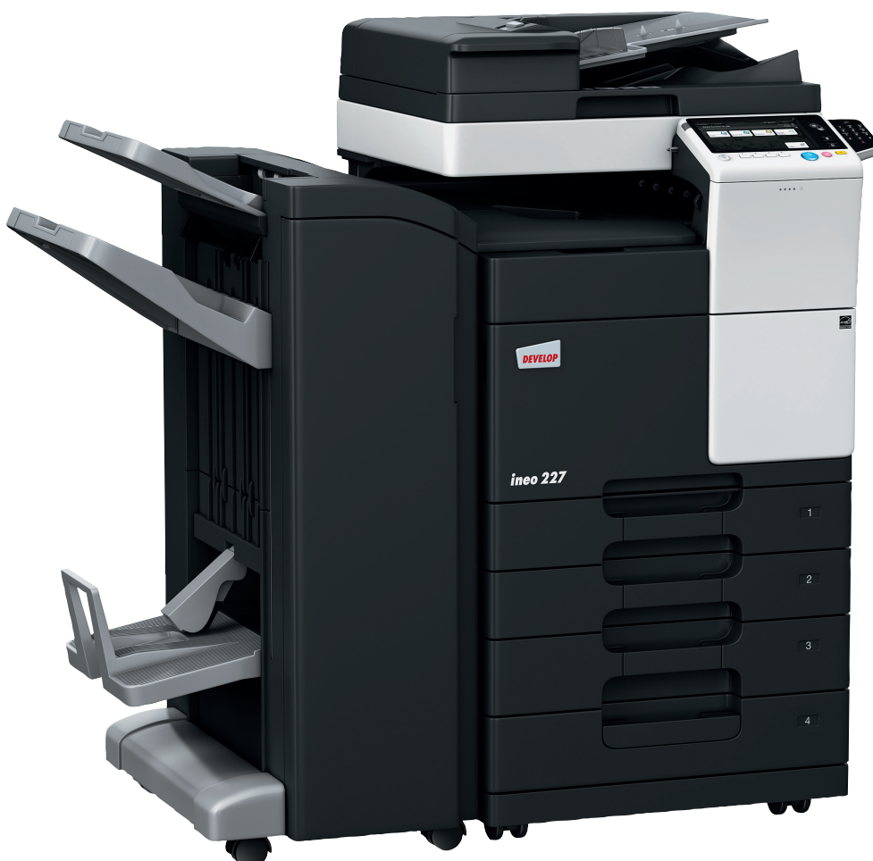
ineo 227 with document feeder (DF-628), staple/booklet finisher (FS-534SD), paper feeder (PC-213) and 10-key pad (KP-101)

The monochrome devices features a variety of energy-saving functions that cut power consumption. Besides saving you money, these green features are also good for the environment – and your carbon footprint.