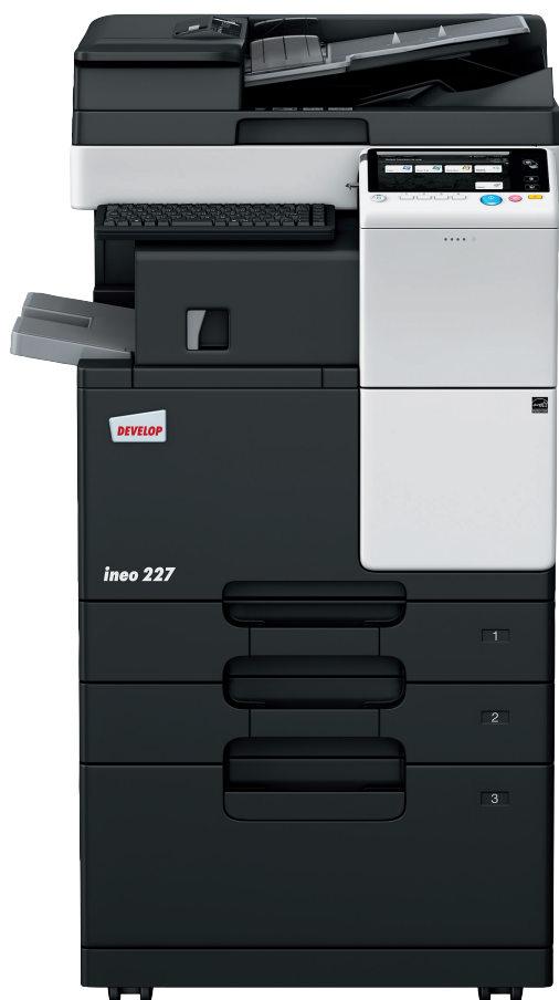
ineo 227 with document feeder (DF-628), inner finisher (FS-533), paper feeder (PC-413) and keyboard holder (KH-102)

Job centres, schools and universities, engineering firms, architect's offices, insurance companies, banks, libraries: many small to mid-sized businesses or organisations don't really need colour printing capabilities. What their users really require is a monochrome multifunctional device that is intuitively easy to use and offers simple mobile usability for the increasing number of mobile office workers.