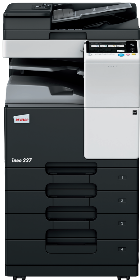
ineo 227 with document feeder (DF-628), job separator (JS-506) and paper feeder (PC-213)