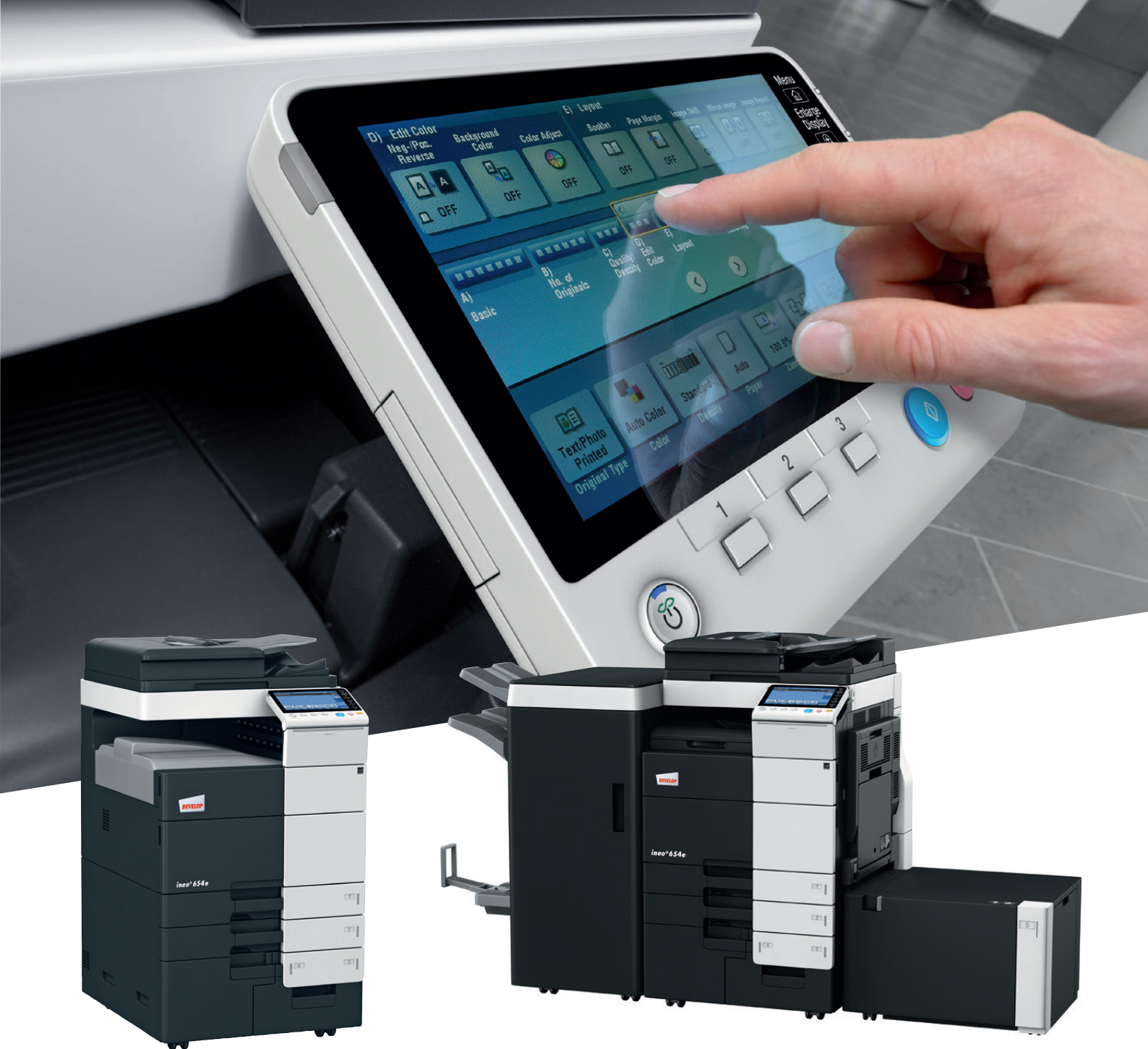
ineo+ 654e with output tray (OT-503)