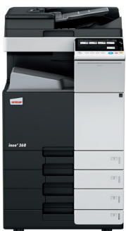
ineo+ 368 with dual scan document feeder (DF-704), output tray (OT-506) and paper feeder (PC-210)

Invest in an ineo+ 368 and you will no longer be dependent on external shops for specialist jobs such as invitations printed on thick, high-quality paper. That will save you time and money. The ineo+ 368 can handle envelopes, recycled paper, pre-printed paper, overhead transparencies, many other media and even thick card of up to 300 g/m 2 . These systems can print broad range of paper formats from A6 to A3+ (SRA3) or user-defined formats and banners of up to 1.2 metres in length. What's more, the numerous finishing options allow booklets of up to 80 pages to be created, letters folded in various ways, handouts stapled or invoices hole-punched. Almost any job can be produced in-house on an ineo+ 368.