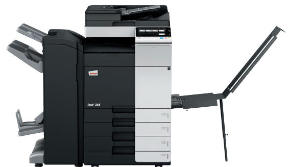
ineo+ 368 with dual scan document feeder (DF-704), staple/booklet finisher (FS-534SD), banner tray (BT-C1e) and paper feeder (PC-210)