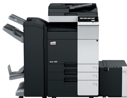
ineo+ 368 with dual scan document feeder (DF-704), staple/booklet finisher (FS-534SD), large capacity tray (LU-302) and paper feeder (PC-410)