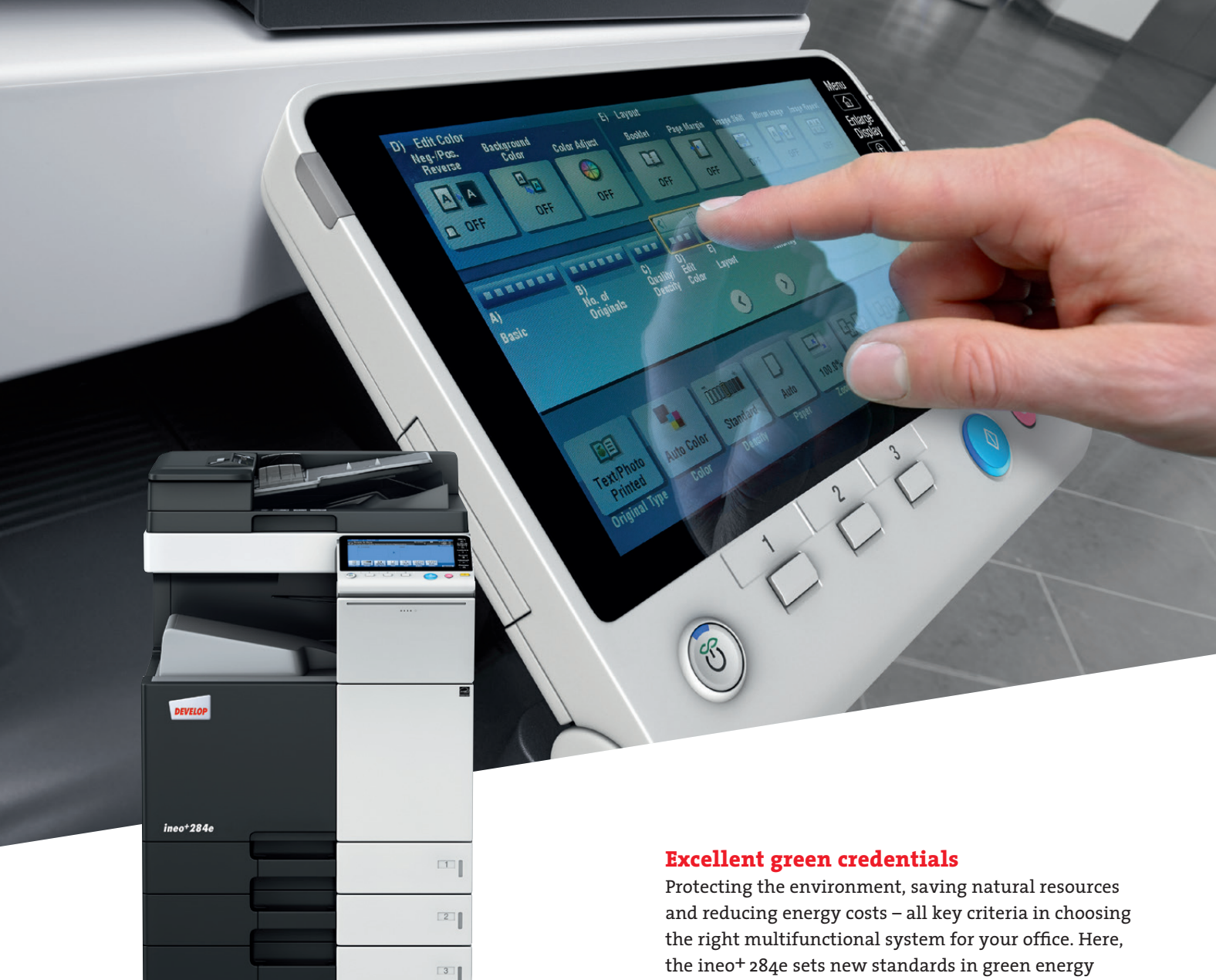
dual scan document feeder (DF-701)