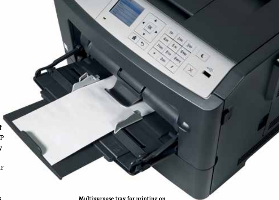
Multipurpose tray for printing on special media such as envelopes

Are high-volume print jobs commonplace in your business? With a maximum capacity of 2,000 sheets you can be sure that the ineo 4000P will not run out of paper. And if you frequently print on different kinds of paper, e.g. with or without your corporate logo, you can have your ineo 4000P equipped with up to three paper trays (with 250 or 550 sheets). If the trays are stocked with different kinds, sizes and weights of paper (A6–A4 and 60–163 g/m 2 ), you ensure your staff to waste no time switching from one kind of paper to another, or running back to a printer that has run out of paper.