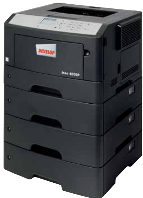
ineo 4000P with three additional paper cassettes (PF-P12)

If the operating system on your current printer is frustratingly difficult to follow and the device difficult to use, it is time you considered switching to an ineo 4000P. Its 2.4-inch colour display ensures intuitive operability and highlighted menus show users the system's status, operating options and settings. What's more, a folder-like navigation concept means the ineo 4000P is easier to use than many older systems. This saves your staff time and effort in everyday printing jobs. And nobody will have to consult an operating manual before using this new printer.