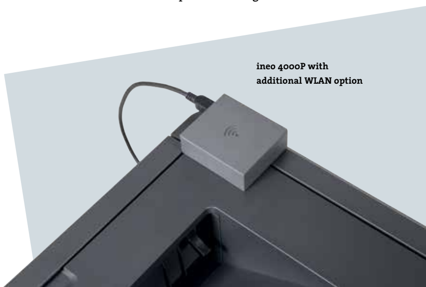
ineo 4000P with additional WLAN option

* Please note: up to 3 PF-P11 or PF-P12 trays can be combined with each other