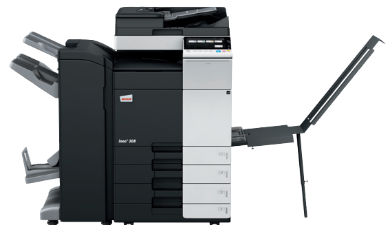
ineo+ 308 with dual scan document feeder (DF-704), staple/booklet finisher (FS-534SD), banner tray (BT-C1e) and paper feeder (PC-210)