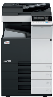
ineo+ 308 with dual scan document feeder (DF-704), output tray (OT-506) and paper feeder (PC-210)

Invest in an ineo+ 308 and you will no longer be dependent on external shops for specialist jobs such as invitations printed on thick, high-quality paper. That will save you time and money. The ineo+ 308 can handle envelopes, recycled paper, pre-printed paper, overhead transparencies, many other media and even thick card of up to 300 g/m 2 . These systems can print broad range of paper formats from A6 to A3+ (SRA3) or user-defined formats and banners of up to 1.2 metres in length. What's more, the numerous finishing options allow booklets of up to 80 pages to be created, letters folded in various ways, handouts stapled or invoices hole-punched. Almost any job can be produced in-house on an ineo+ 308.