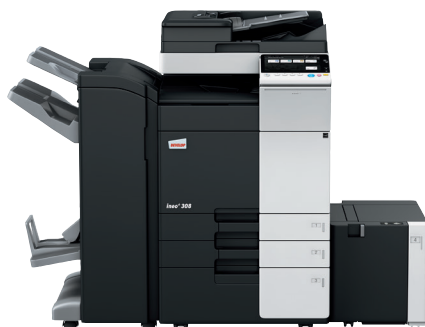
ineo+ 308 with dual scan document feeder (DF-704), staple/booklet finisher (FS-534SD), large capacity tray (LU-302) and paper feeder (PC-410)