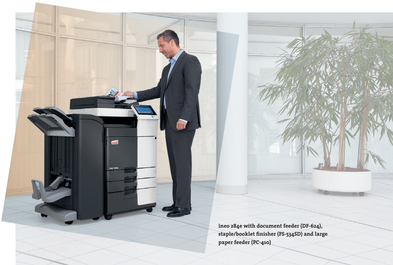
ineo 284e with document feeder (DF-624), staple/booklet finisher (FS-534SD) and large paper feeder (PC-410)

These black-and-white systems come with a number of energy-saving features that cut power consumption by over 40% compared to predecessor models. While this kind of economy saves money, other green features are ecologically beneficial. And that means DEVELOP's ineo e line-up is not only good for the environment but also boosts the owner's green credentials.