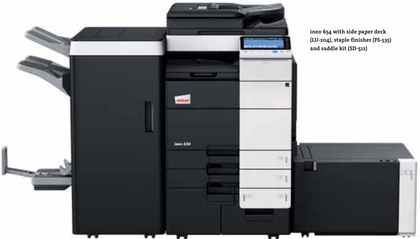
ineo 654 with side paper deck (LU-204), staple finisher (FS-535) and saddle kit (SD-512)

Viruses, Trojan horses, hacker attacks: these days, no business can afford to ignore the challenging issue of IT security. That's why the ineo 654 is certified to ISO 15408 EAL 3, the industry's security standard for multifunctional systems. What's more, it also comes equipped with numerous data-security features such as IPsec encryption, which ensures secure communication channels for all documents passing through your company's network. There is no danger of confidential documents or data getting into the wrong hands either since access to the system can be restricted to authorised users by means of the standard hard-disk encryption kit and authentication technology. This way, we ensure your sensitive data stay secure – now and in future.