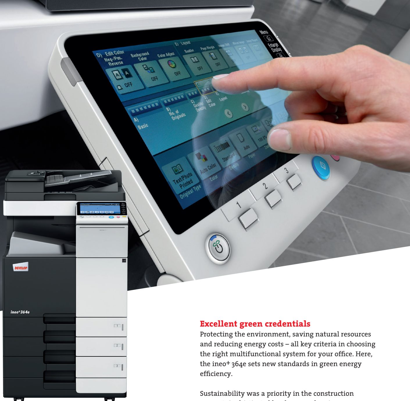
ineo+ 364e with paper feeder (PC-210) and dual scan document feeder (DF-701)