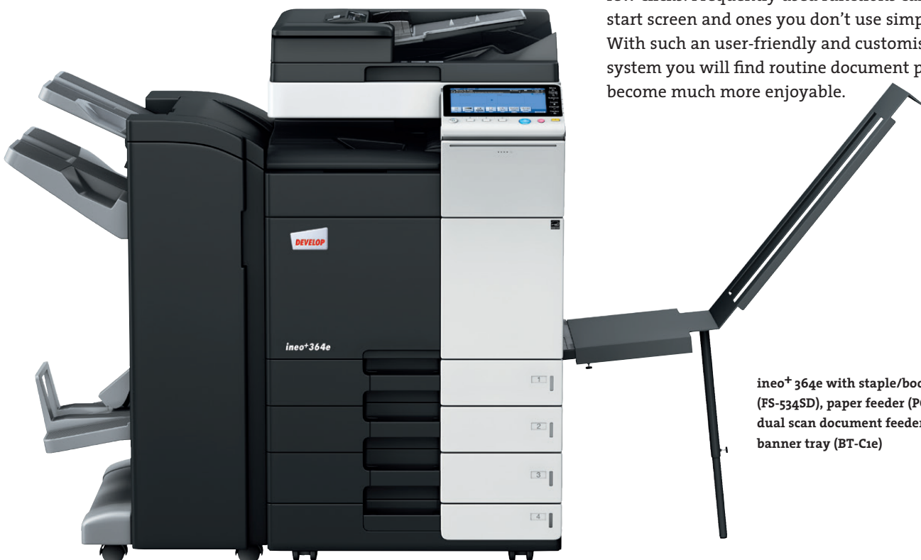
ineo+ 364e with staple/booklet finisher (FS-534SD), paper feeder (PC-210), dual scan document feeder (DF-701), banner tray (BT-C1e)

Many multifunctional office systems are anything but user-friendly. The ineo+ 364e, in contrast, is simplicity itself. An intuitive, easily understandable operating concept ensures that it is as easy to use as your smartphone or tablet. The 9-inch capacitive touchscreen comes with familiar multi-touch operations such as flick, drag&drop and pinch in&out – so you will feel at home in this system in no time at all. Thanks to a new menu navigation structure you can see all functions in one go and select the settings you want with just a few clicks. Frequently used functions can be left on the start screen and ones you don't use simply removed. With such a user-friendly and customisable office system you will find routine document production jobs become much more enjoyable.