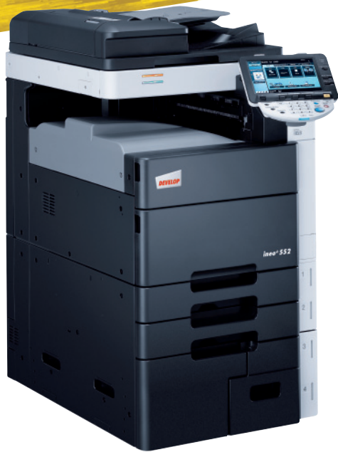
ineo+ 552 with output tray (OT-503)