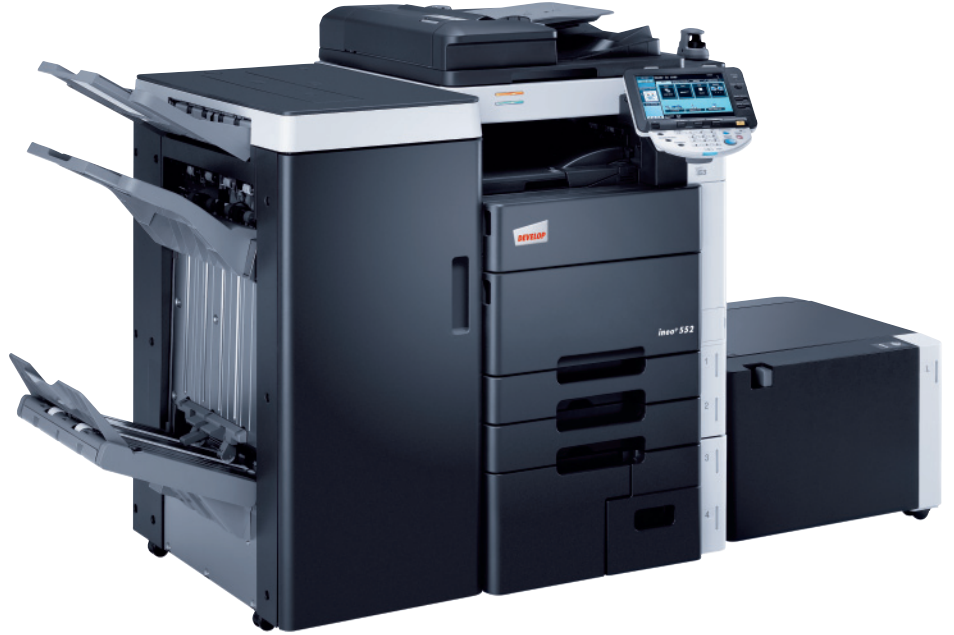
ineo+ 552 with staple finisher (FS-526), saddle kit (SD-508), working table (WT-506), biometric authentication (AU-102) and large capacity tray (LU-204)